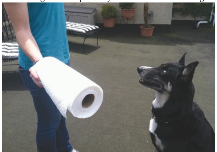
Photo B - Look back at handler between neutral object 2.

History – Summer was adopted through a private rescue a few months prior. Her owner had already worked with a trainer who helped her begin to learn how to work for food rewards and started her on some basic obedience as well as a "nothing in life is free" program. The other trainer felt that Summer was too aroused while outside to be able to be trained and told the owner her behavior around other dogs would probably never be able to change.➤