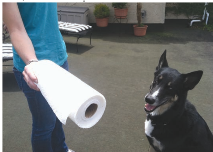
Photo A - Looking neutral object.