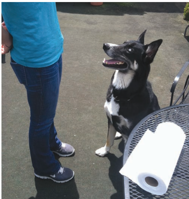
Photo D - Look back at handler between neutral object.

Presenting behavior – Summer would lunge, growl, bark, snap at other dogs while on leash, or while dragging her leash at a local pet store. The behavior presented with more intensity when in the presence of larger, darker colored dogs. Though the behaviors were disconcerting, Summer had never bitten another dog even though she was not always restrained in their presence.