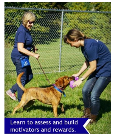
Learn to assess and build motivators and rewards.

Get ready to eat, sleep, and breathe dogs. If you are looking for an in-depth learning experience alongside a world-class team of trainers, then the hands-on workshops are for you. This is a fun, challenging, and comprehensive week of training with a chance to develop your skills and have them evaluated to earn a certificate. Upon completion of your week's work, you will receive a frameable diploma highlighting your studies and accomplishments. Every day we will be doing hands-on training work with a variety of dogs at our modern training facilities and shelter campuses. This will make a huge difference in your skills and in the lives of the shelter dogs you will be helping by providing needed enrichment and manners training.